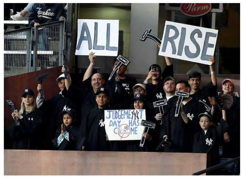
Fans wear robes and raise foam gavels in The Judge's Chamber.