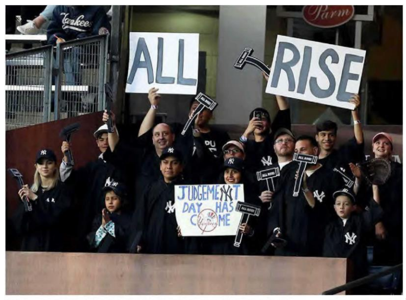
Fans wear robes and raise foam gavels in The Judge's Chamber.

In May 2017, Yankee Stadium opened THE JUDGE'S CHAMBERS—three rows behind Mr. Judge in right field in which 18 fans are given black judge's robe t-shirts with his number 99 on the back and a foam gavel with ALL RISE on it, which they can take home: